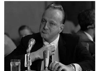
Frank "Lefty" Rosenthal before the Senate Investigators Subcommittee, Sept. 8, 1961 during a probe of organized gambling.

"Despite the sort of edgy theme, this museum will be historically accurate and it will tell the true story of organized crime," Knowlton said. "The plan is to give people a kind of gritty taste of what it would have been like to be not only a person involved or affiliated with organized crime, but also what it would have been like to be in law enforcement."